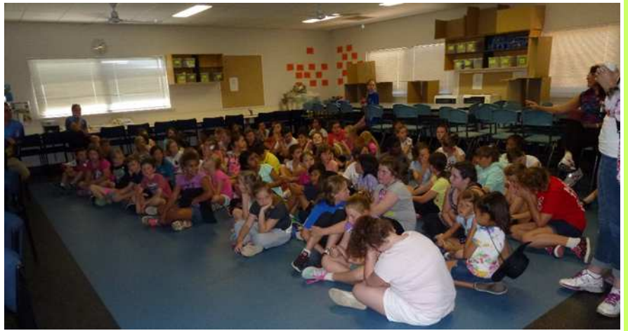
BELGIAN GARDENS STATE SCHOOL

Some of the fish tanks at BGSS – The only primary school in the world breeding Clown Fish – Only 2 other high schools in the world, breed the fish.